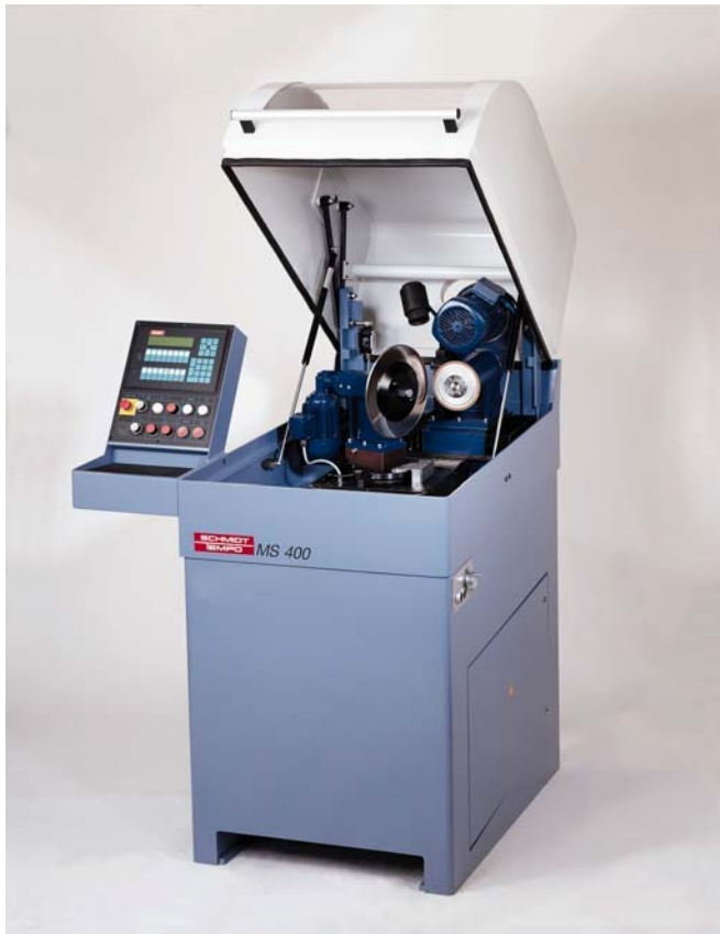
For fully automatic grinding of single, double and compound bevels with CBN-quality